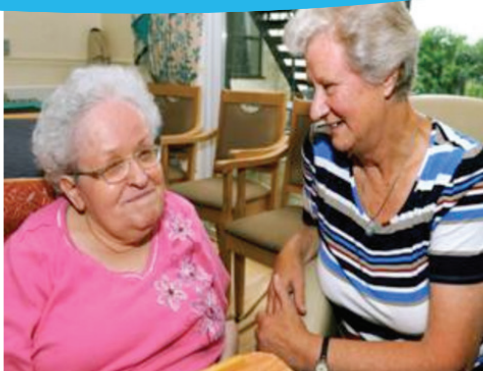
C.H.A.aT in action.