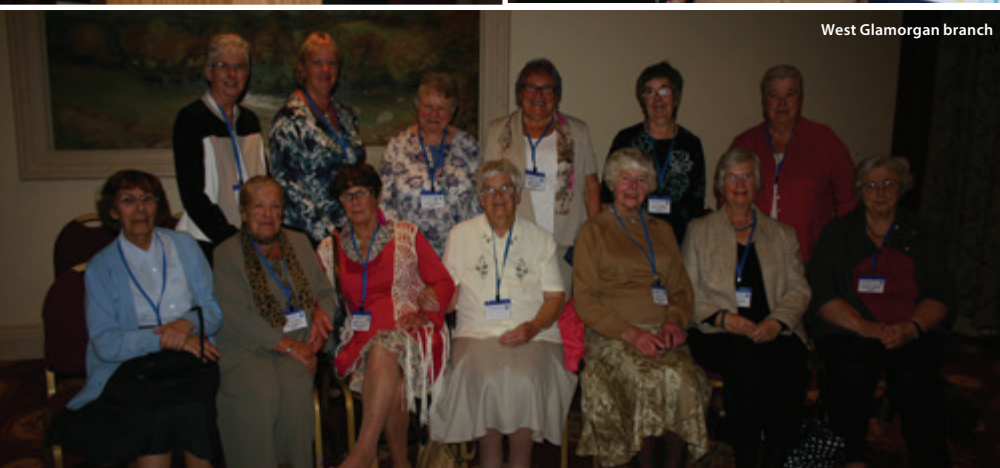
West Glamorgan branch