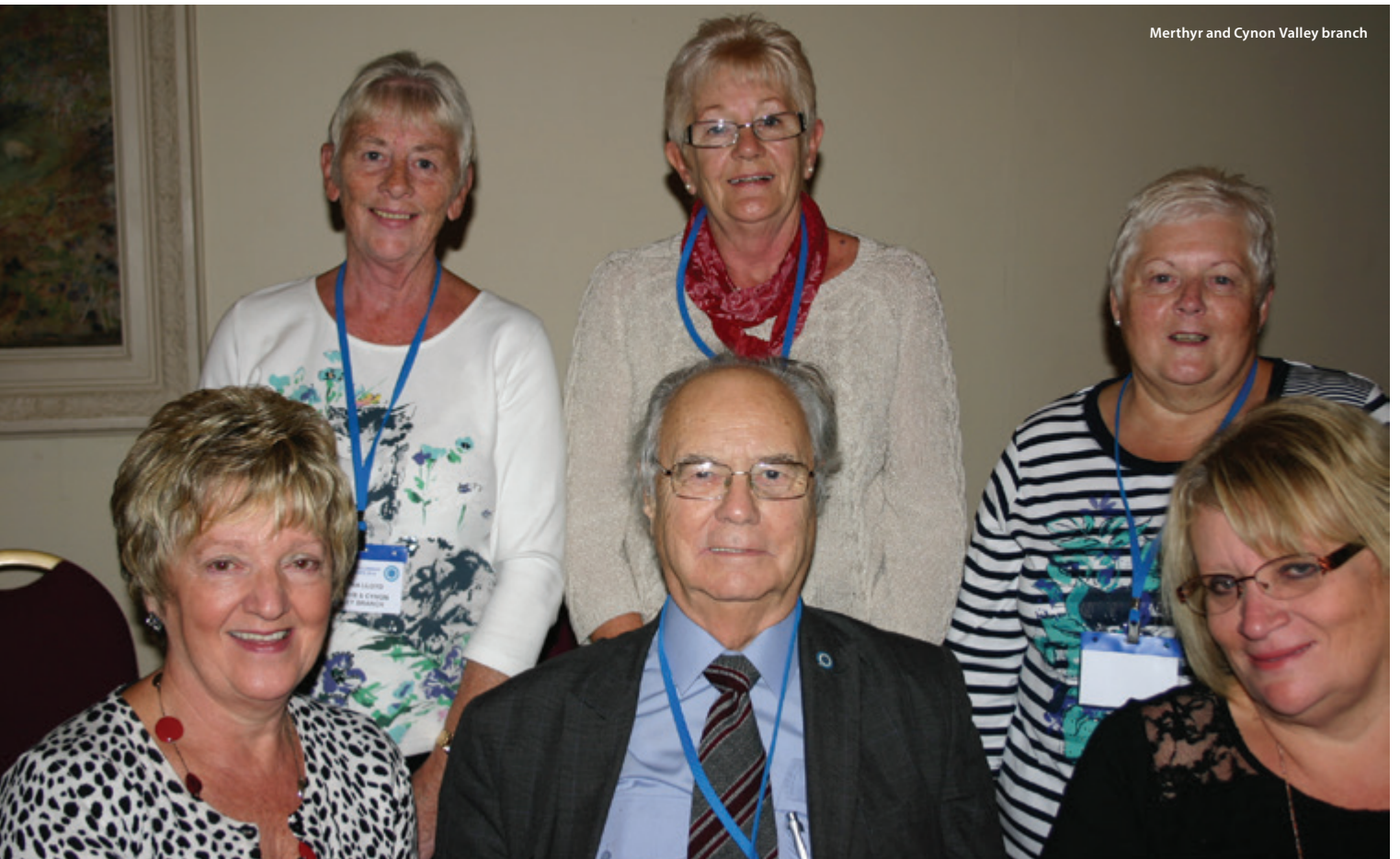
Merthyr and Cynon Valley branch